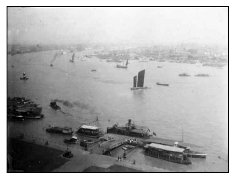
Image 4 Pudong, Special economical zone, across from Shanghai, China (1930)

4. We will have a better stand in negotiating with neighboring countries that need to use the sea route. Malaysia will want to use a cheap route in developing the northern part of Malaysia, they will have to use the Thai Canal. So it will help the development in the 3 southern provinces because there will be many jobs to complete.